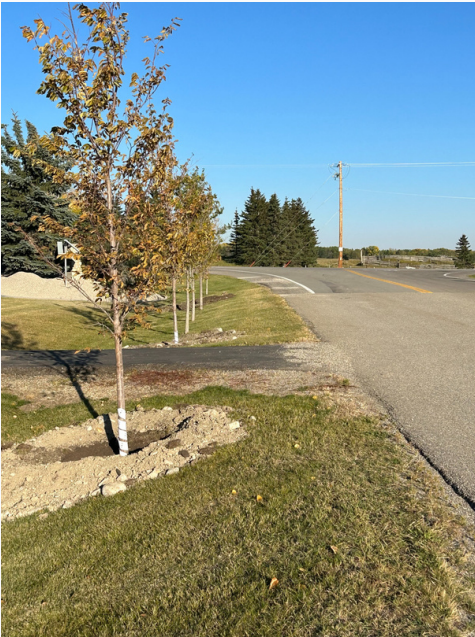
ZONE 1 NEW TREES FRESHLY PLANTED