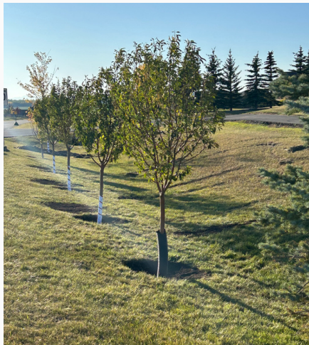
ZONE 1 NEW TREES FRESHLY PLANTED