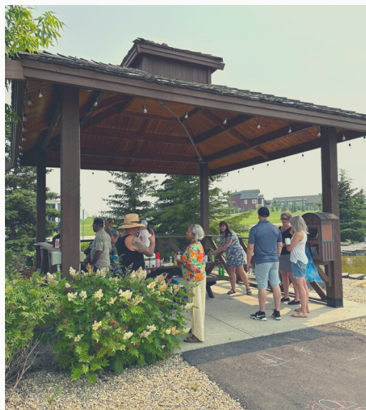
ABOVE: PHOTOS FROM SUMMER SOCIAL