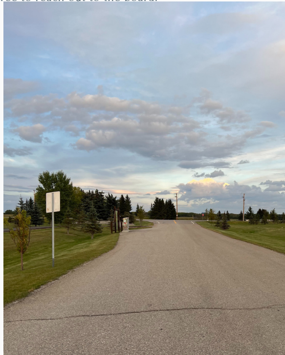
ZONE 1 CURRENT TREE CONDITIONS