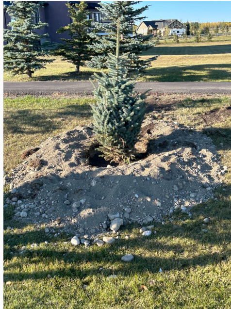
ZONE 1 NEW TREES FRESHLY PLANTED